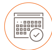
Life Insurance / Annuities

Call (770) 859-2366 or email CCFTeam@cobbfoundation.org to learn more.