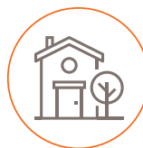
Real estate and other tangible property