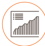
Appreciated stock or securities